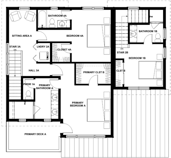
4 UPPER LEVEL - MRKG A2.4 / 1/4" = 1'-0"