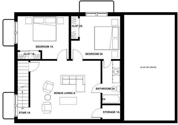
1 BASEMENT - MRKG A2.4 / 1/4" = 1'-0"