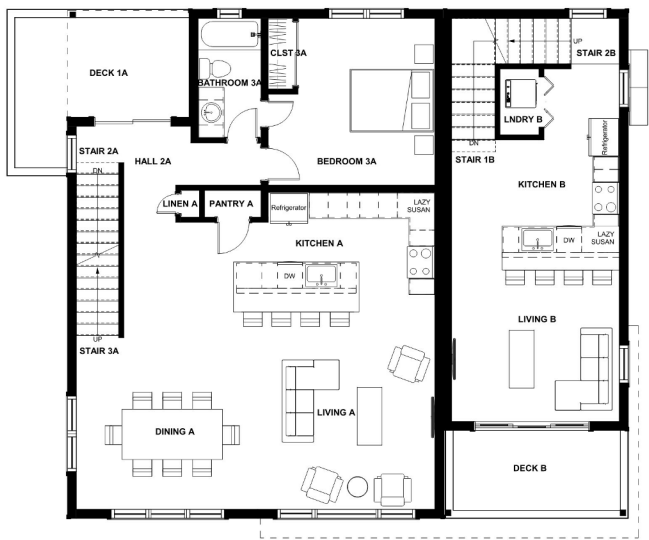
3 MAIN LEVEL - MRKG A2.4 / 1/4" = 1'-0"